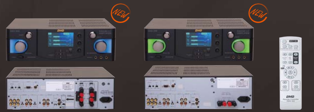
DAS-400 [SE] DAS-200 [SE] RMS-300